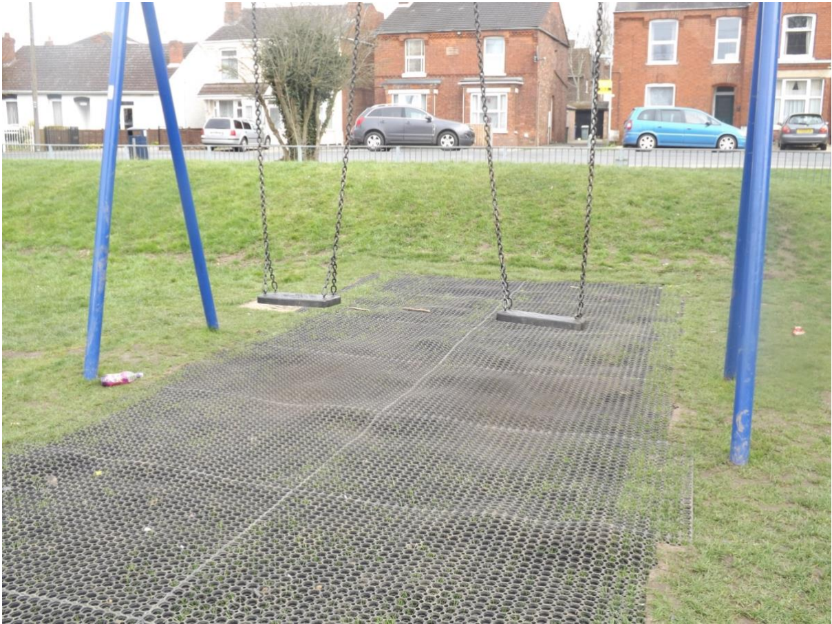
Photo of new surfacing with swings in place

Installation of grass matting surfacing and re-fit of flat bed swings