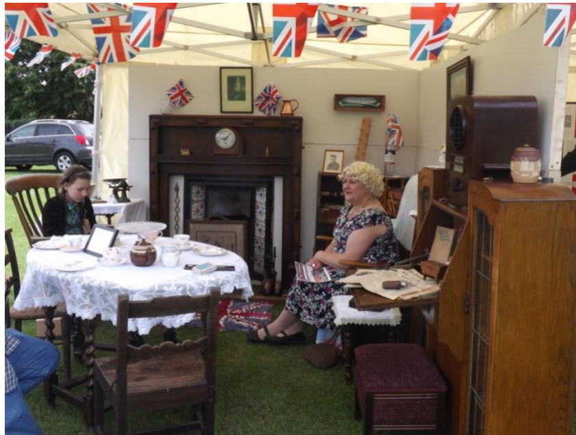
1940's Parlour built especially for the event