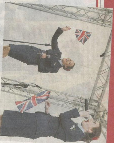
Entertaining the crowds.

Members from the funders, Boston Big Local and Boston Town Area Committee, were extremely happy with what they witnessed.