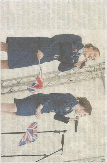
The Dream Belles performing