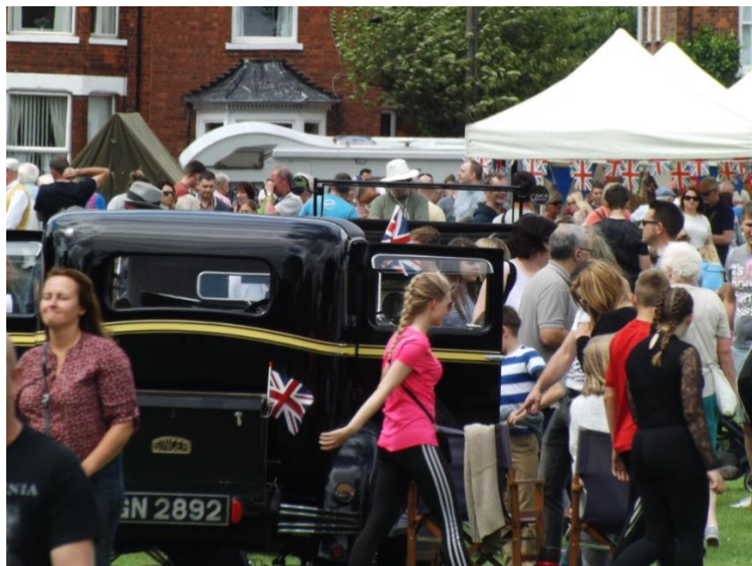
Amazing display of vintage vehicles