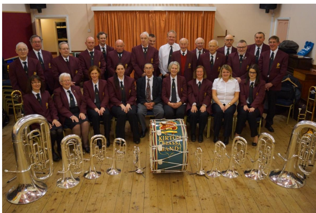
Kirton Silver Band