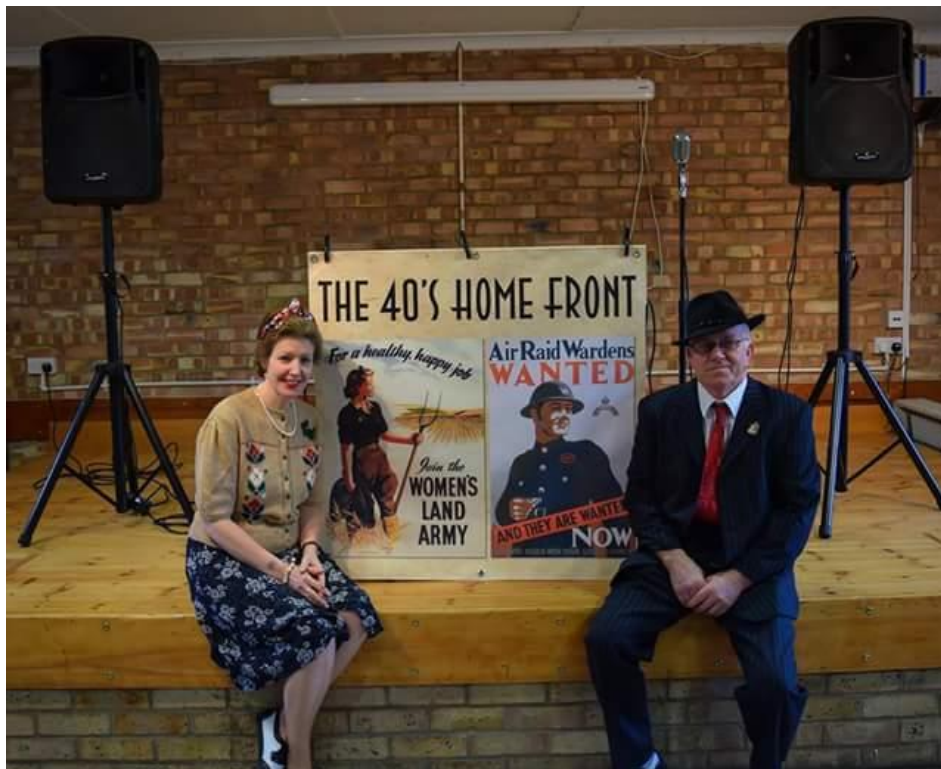
The 40's Home Front