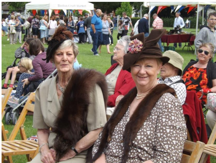
Crowd enjoying the entertainment