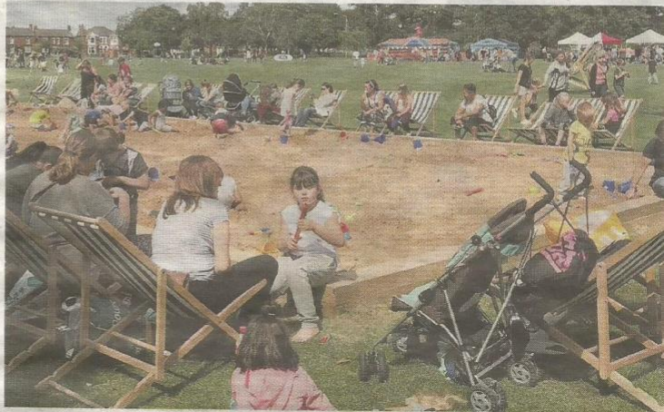
Families flocked to the beach in the park.

Boston's Beach Day event in Central Park has been hailed a huge success by organisers.