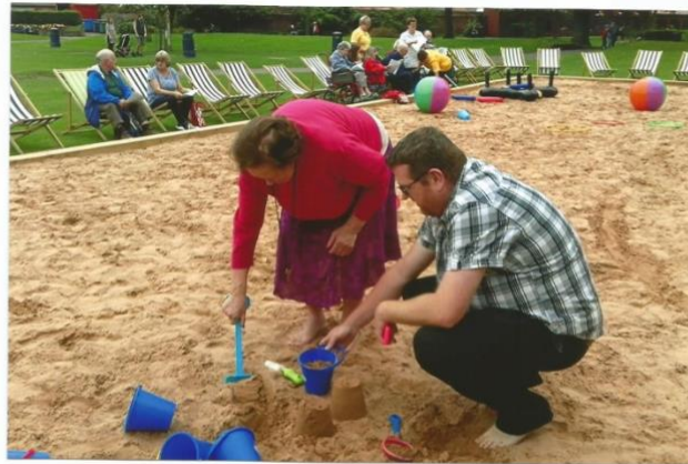
Singing around the beach to the golden oldie records