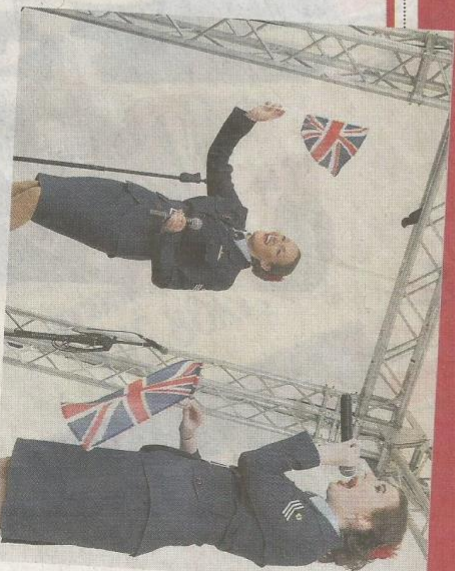
Entertaining the crowds.

Members from the funders, Boston Big Local and Boston Town Area Committee, were extremely happy with what they witnessed.