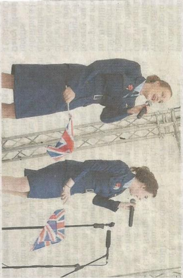
The Dream Belles performing