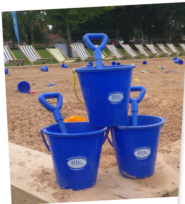
Already to go!