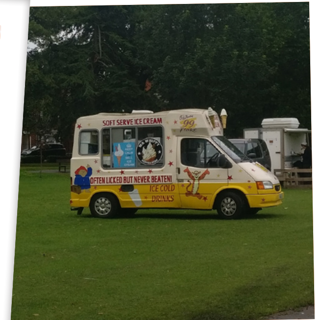
Free Ice Cream For Every Child