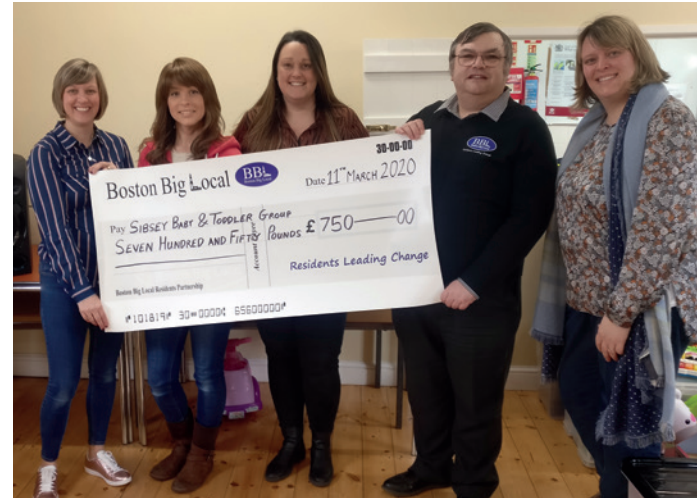
Sibsey Baby and Toddler Group

We also presented this amazing group with their cheque for £1040 to help them cover their rent for their offices at the Len Medlock Centre.