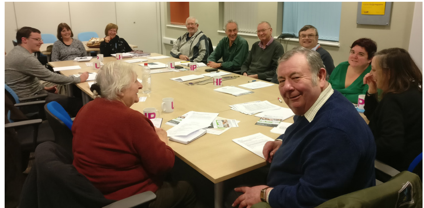
Our BBL Panel meeting held at Chantry House on the Thursday February 13th 2020 from 6pm.

The panel is made up of residents who can share their views and decide which projects to fund inline with our themes. Also in attendance are support members: