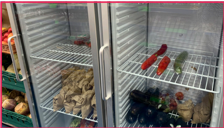
Fridges funded by BBL