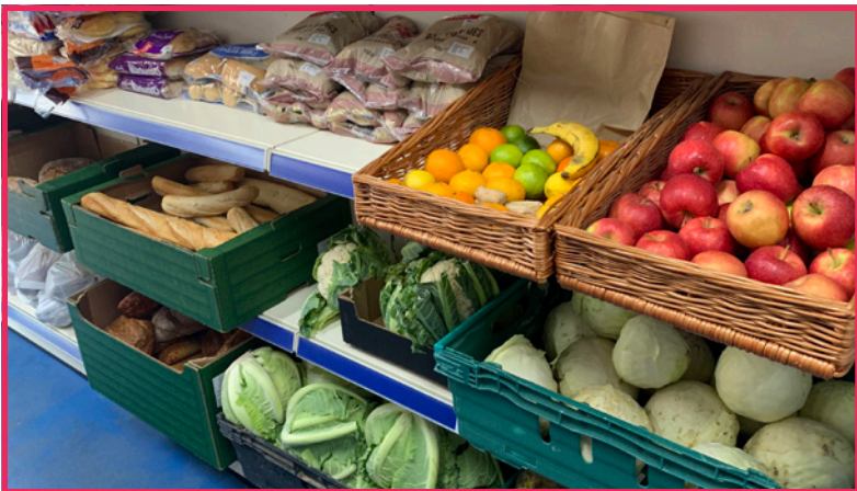
Fruit and Veg