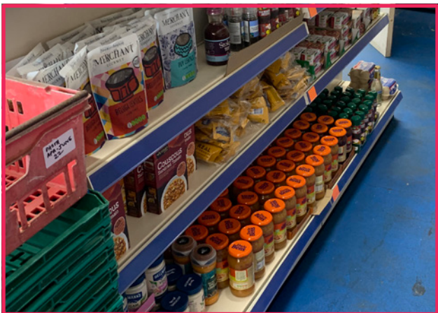
Sauces, Packets and Jars

Restore Pantry provide affordable food to local people in Boston. For a low-cost weekly membership fee people are able to dramatically reduce what they need to spend on their weekly shop.