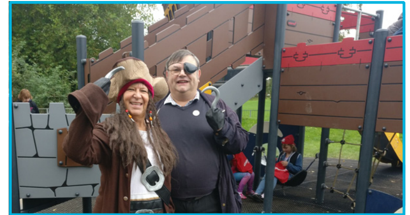
Installed and opened in 2019