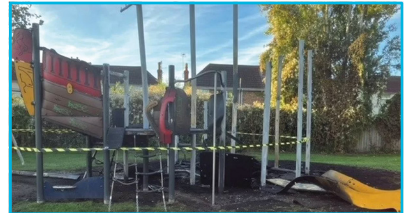
Set on fire on 16th September 2022

Woodville Road play area, around 21:30 on the 16th September vandals set fire to the Pirate ship play equipment that we funded with £32,000 back in 2019.