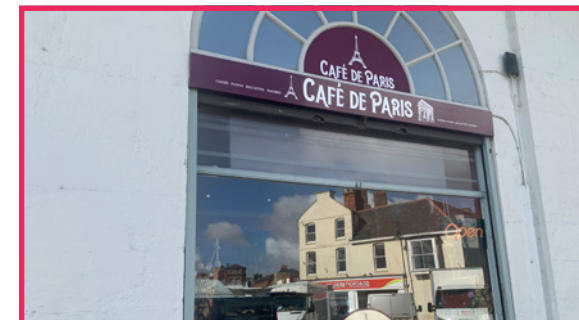
Cafe De Paris