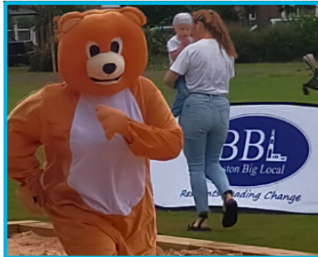
Teddy Bears Picnic

The Boston Beach Event with Donkeys, Giant Tortoises, Face Painting, Bouncy Castles, Art and Crafts, Competitions and much more.