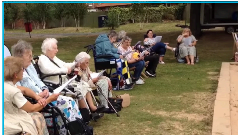
Sing-a-long around the beach