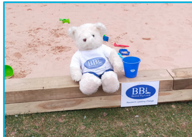
Botolph bear at the picnic