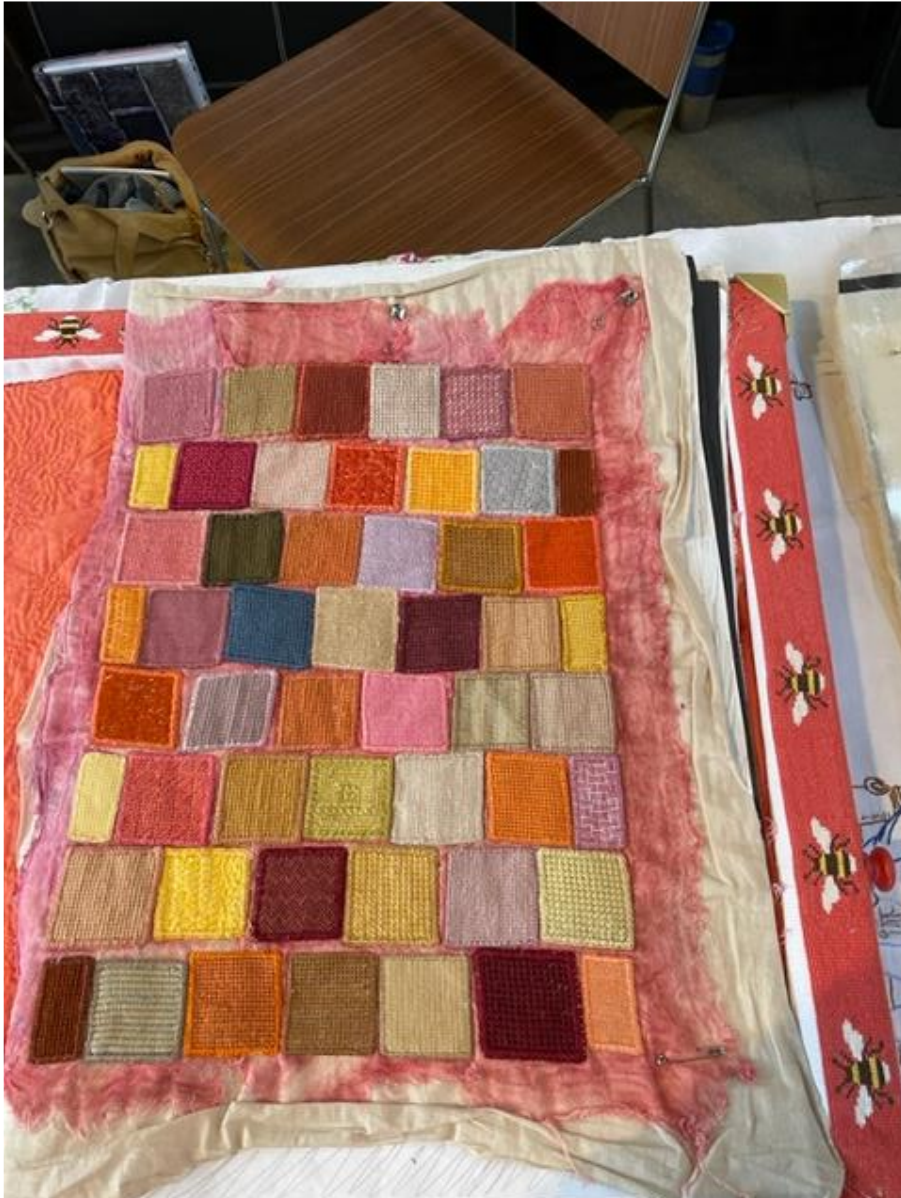
Covers and borders