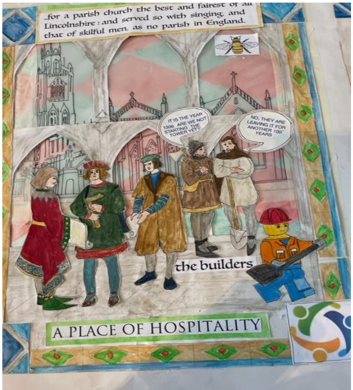
The Stump – St Boltoph's – our church