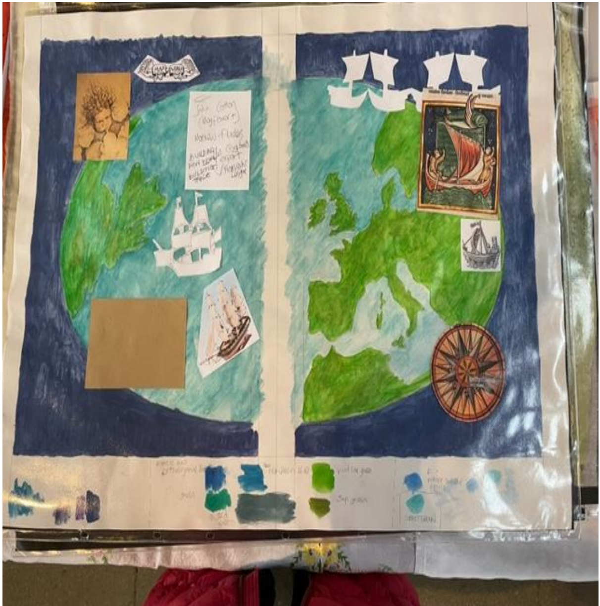
Building trade and communications