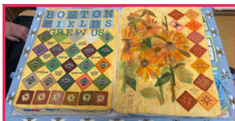
Boston Fields page in Boston 2020 book