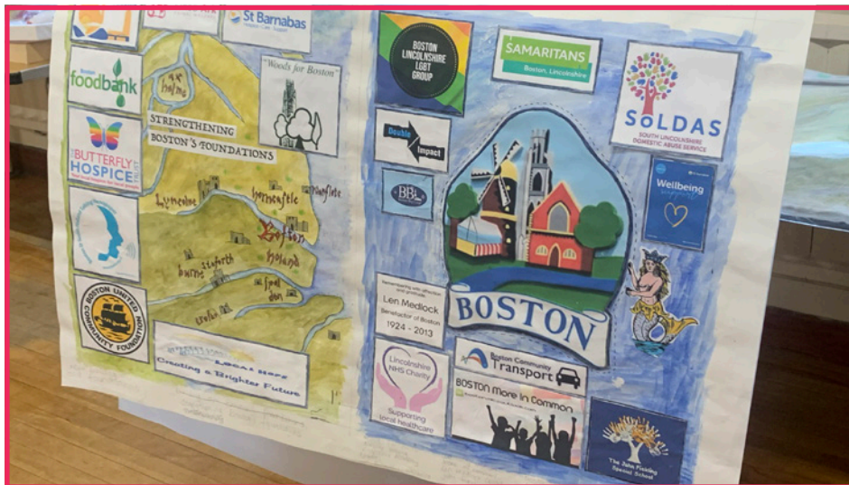
New book plan for community page

squares for people to embroider for the book. One person even fed back that they felt the connection they had through this project saved their life.