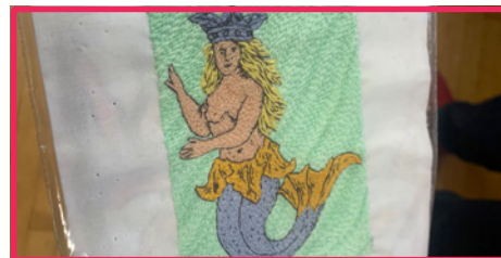
Mermaid for community page