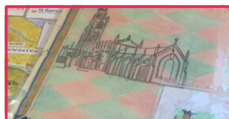
Stump image for new book