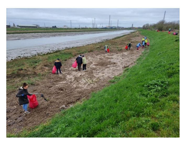
Haven Litter Pick, 1st April 2023