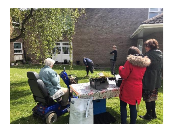
Dementia Awareness Week at the Friendly Bench