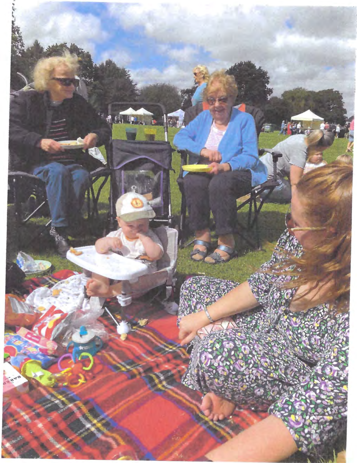
Four generations out for the day