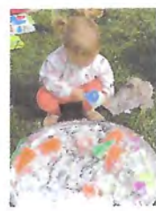
Flour and water play