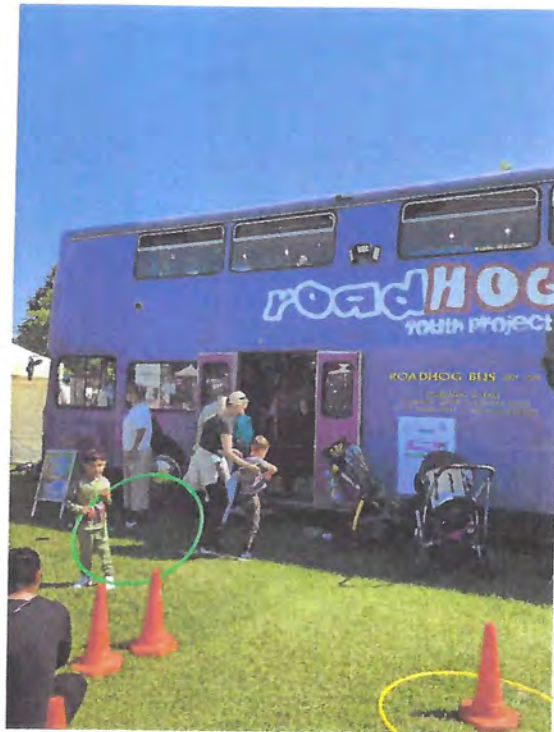
Youth Road Hog Bus visits several villages each week