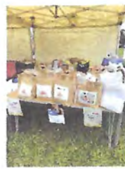
C/C's bags of clothes