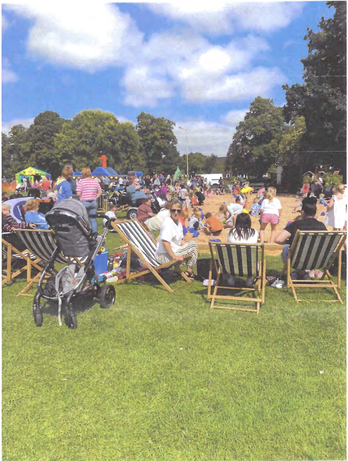
What a brilliant two day event!