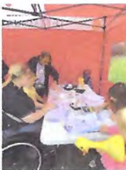
Art and crafts