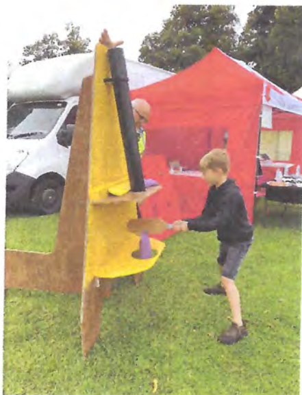
Catch the Rat