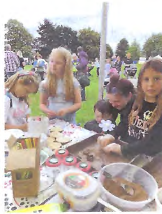
Wild Flower Bombs