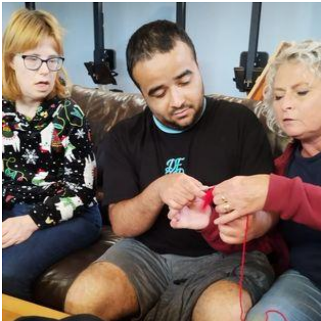
Some of the lovely volunteers from Thistles having a go at making poppies.

We will be hoping for better weather for our next litter pick.