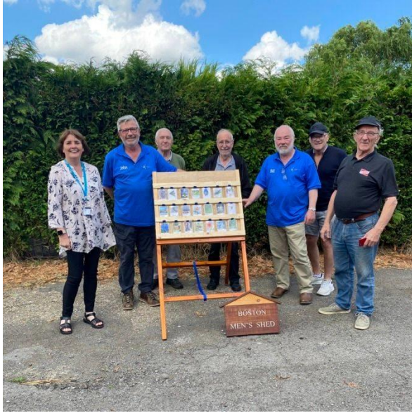
Guess Who game made for us by the Men's Shed.